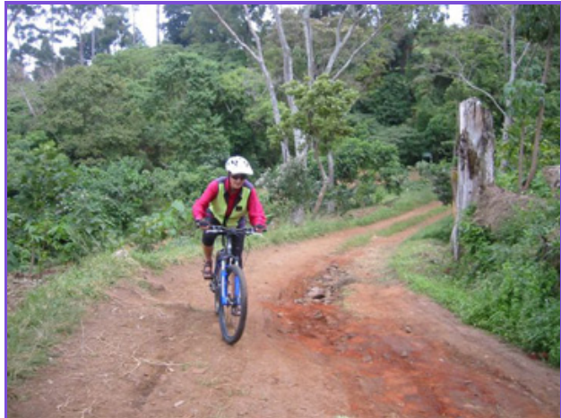
Excellent mountain bikes