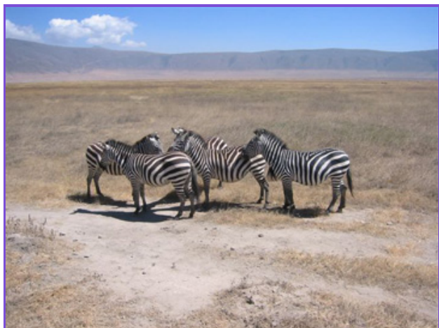
In touch with the wild