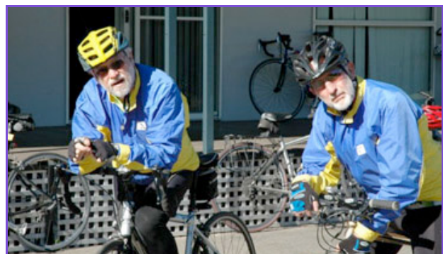
Now they are !