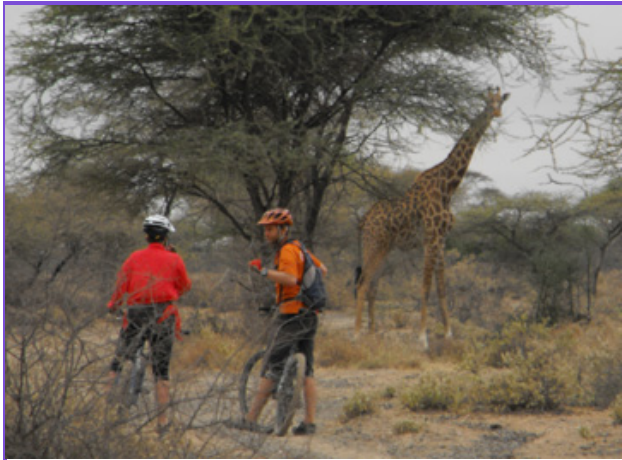
A dream comes true