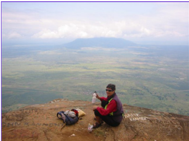
Well worth the climb