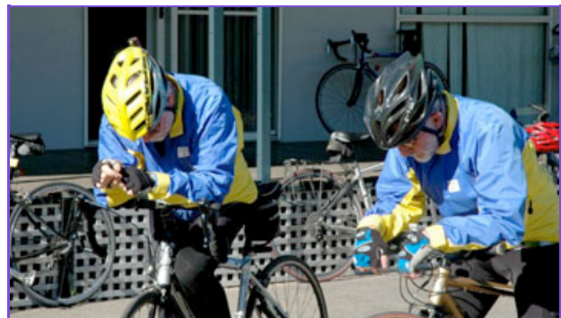
The 'Col Twins' (volunteer trainees) are not paying attention!

Bike for Life information is at http://www.bikenorth.org.au/bike4life/