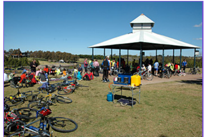
Never have so many turned up for so much so happily

Not only did people turn up for the rides and come back from them smiling (as usual), but they stayed around and enjoyed the fabulous lunch put together by a small team of helpers.