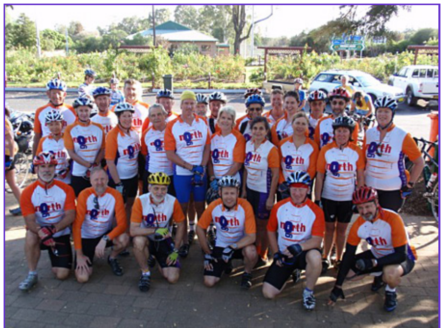
A sea of Bike North riders in Cowra

Our lead up training to TdC worked well and we both felt pretty good. But best of all was the large number of people taking part in TdC and having a great time. Several did their longest ever day ride, some were recent Bike for Life graduates and were now out doing 80 kms rides in the country! Others were keen to find the best coffee shop in Canowindra, or sink a pint at the pub après ride. The excellent weather helped.