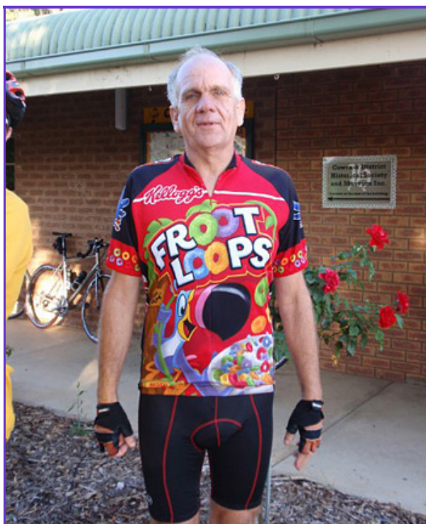
A good breakfast is essential before a ride

I had not prepared myself mentally for this at all, partly because it was not very long, and partly because I was concentrating on the work we had been doing with equipment for the events.