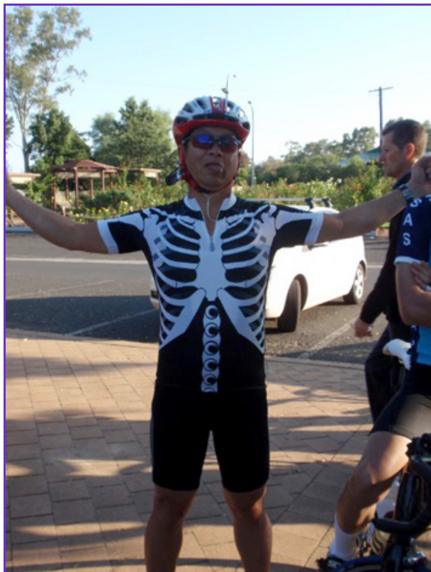
He's been losing weight lately

Everyone joined in the "Jersey Days" with great spirit. On day 2 we had world champions, Tour de France leaders, Kings of the mountains and Paris to Dakar by Bike veterans. Day 3 saw the largest number of Bike North jersey wearing riders ever assembled. A few of the many wonderful contributions to the Silly Jersey day included Cats in the Hat, a crash test dummy, a skeleton, and the now familiar Pinarello Princesses complete with tiaras.