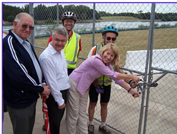
Maxine McKew attempting to open the gates with some small bolt cutters. Fortunately a key for the lock was available.